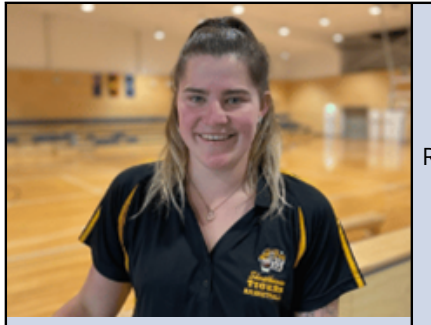
Step 9: Who's Who

Contact <u>enquiries@shoalhavenbasketball.com.au</u> to learn more or let us know what skills you can share.